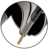
CINTURATO™ GRAVEL RC 35-622